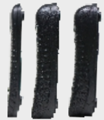
DIFFERENT SIZE PADS